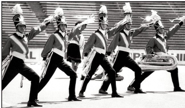
Guardsmen, 1985 (photo by Donald Mathis from the collection of Drum Corps World).

It was also that year that the now-famous,