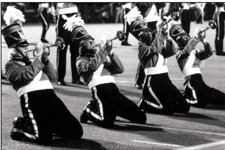
Guardsmen, 1979.