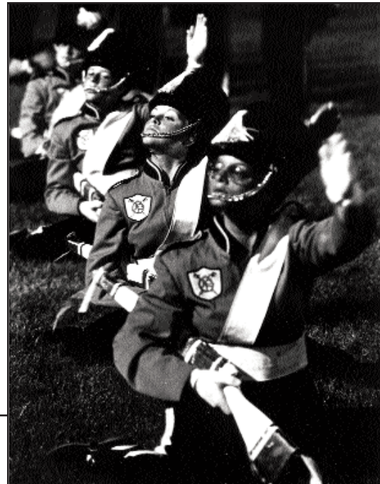
Guardsmen, 1978.

United States and Canada, 232 competed in the two-day preliminary trials. The Guardsmen scored an 83.75 in the prelims, tying for 10th place.