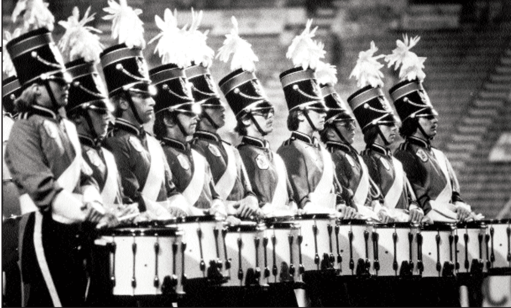
Guardsmen, 1979.

After the exciting year in 1976, the corps failed to make 1977 DCI Finals in Denver, CO. Taking 16th in prelims, the corps left Denver