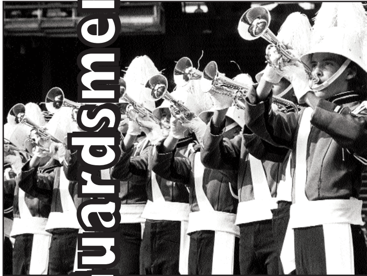
Guardsmen, 1976.