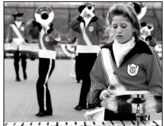
Guardsmen Cadets, 1993.

of the crowds. Those who marched in the orange and black will always remember friendships and wonderful times. Even today, when they hear the beginning chords of Hail Britannia they can't help but think, "The British are coming! The British are coming!"